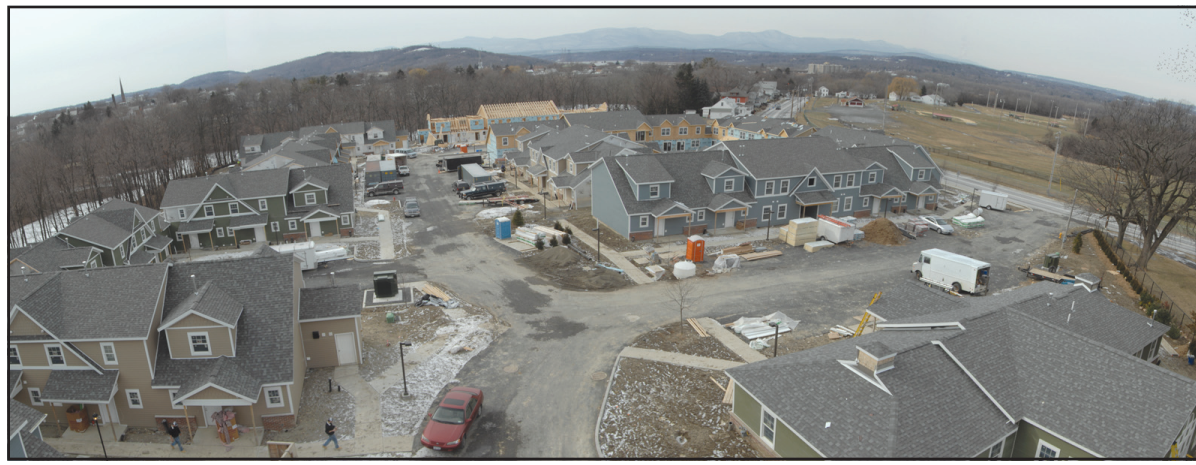
Aerial of the Crosswinds at Hudson project, Hudson